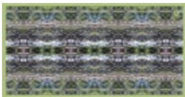
HERBERT LAKE, CANADA