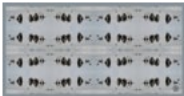
FRED LAKE, CANADA