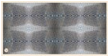
STUDIO BELL / NATIONAL MUSIC CENTER CALGARY - CANADA