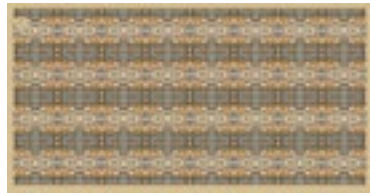
HONFLEUR, NORMANDY - FRANCE