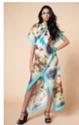
FIRST DRINK CALGARY - CANADA