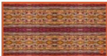
WHIRLPOOLS OF COLOUR, PARIS - FRANCE