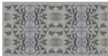
PHILHARMONIE, PARIS - FRANCE