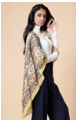
HONFLEUR, NORMANDY - FRANCE