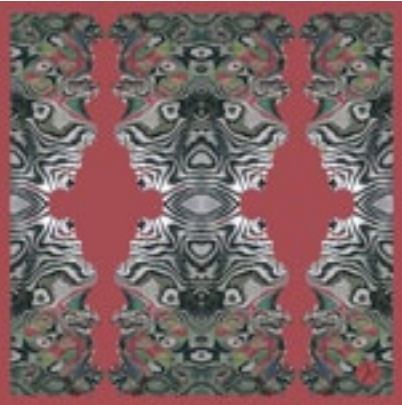
CENTURY GARDENS, CALGARY