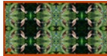
FLAMINGOS AT CALGARY ZOO, CANADA