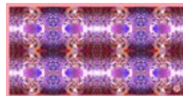
STAMPEDE YOUNG CANADIANS, CALGARY - CANADA