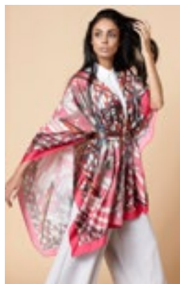
THE PINK BUILDING PARIS - FRANCE