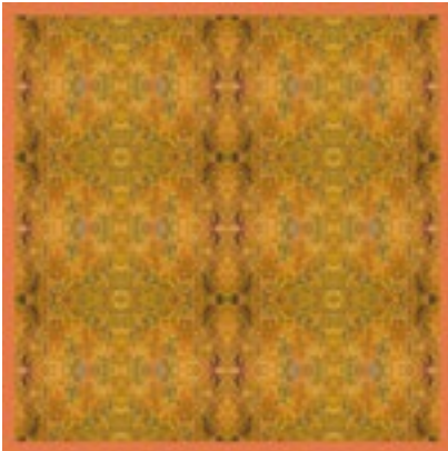
GLENBOW RANCH, CALGARY