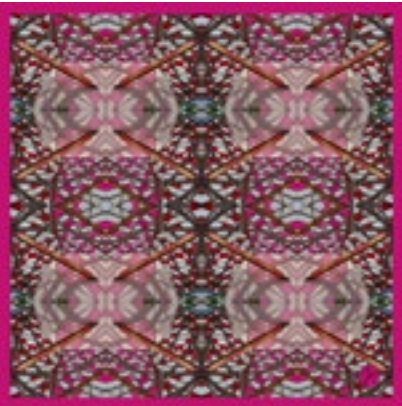
THE PINK BUILDING, PARIS