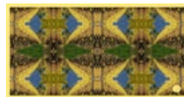
LARCH HILLS, BRITISH COLOMBIA - CANADA