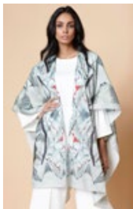
PHILHARMONIE PARIS - FRANCE