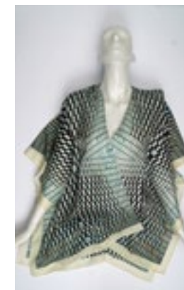
STUDIO BELL / NATIONAL MUSIC CENTRE CALGARY - CANADA